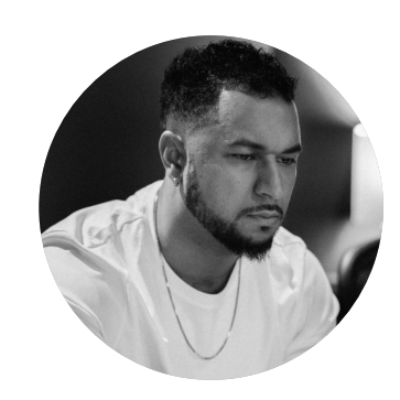
T-MINUS GRAMMY WINNING PRODUCER