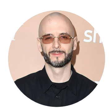
NOAH SHEBIB GRAMMY WINNING PRODUCER