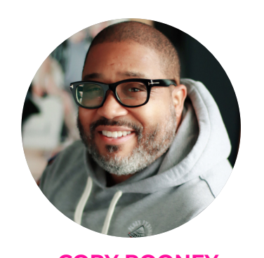
CORY ROONEY GRAMMY WINNING PRODUCER