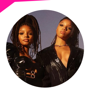
CHLOE X HALLE